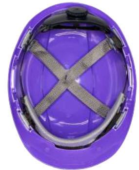
Textile Ratchet fit