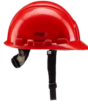
Textile Ratchet Fit