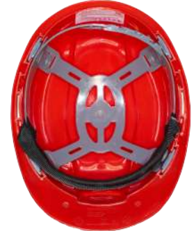
Plastic Slip fit