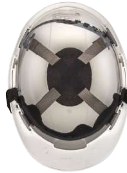
Textile Slip fit